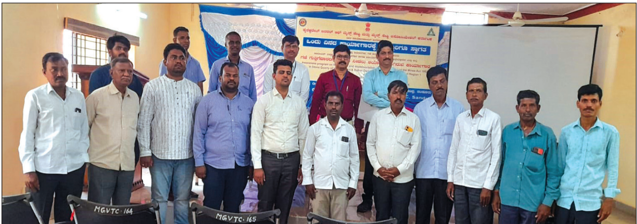
A snap with dignitaries