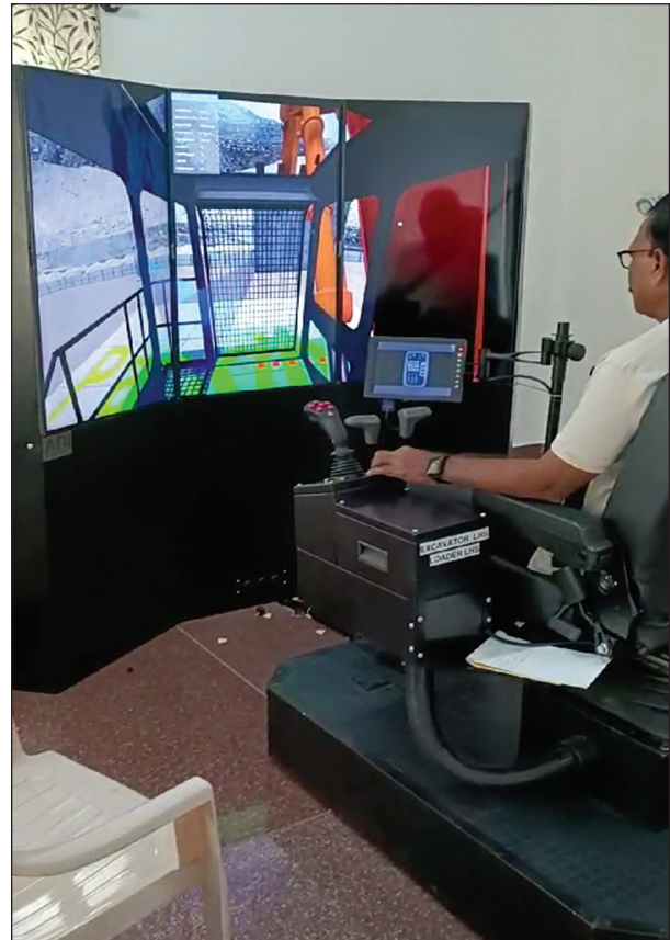
First-aid, CPR & Simulator Training at GVTC, C. N. Halli