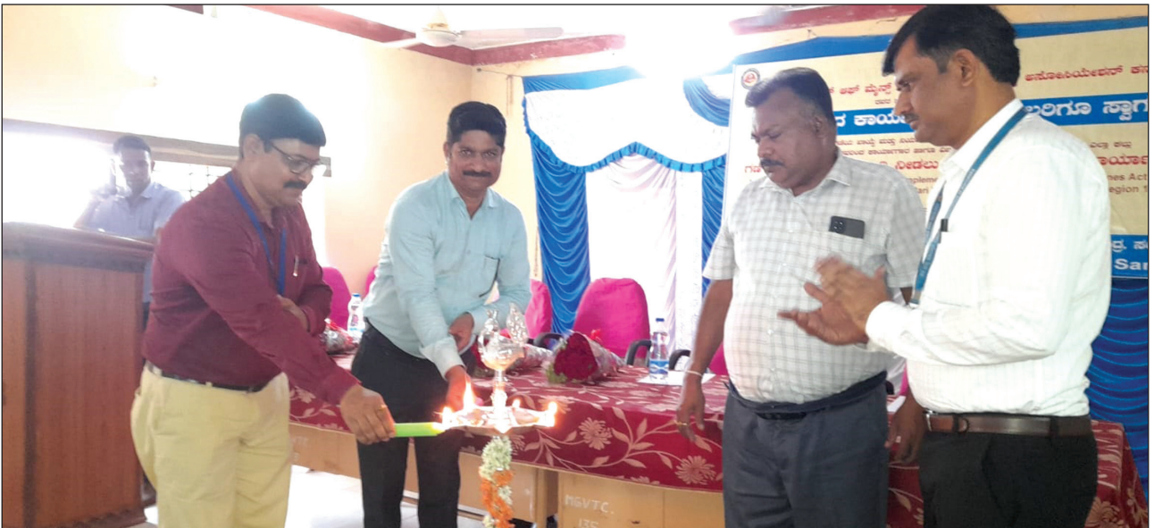
Inauguration of the Awareness Programme by the dignitaries