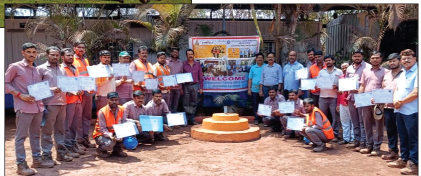
Skill Development Certificate issued at A. Narayan Iron Ore Mine of M/s Vedanta Ltd. & Jhon Iron Ore Mine of M/s R. Praveen Chandra