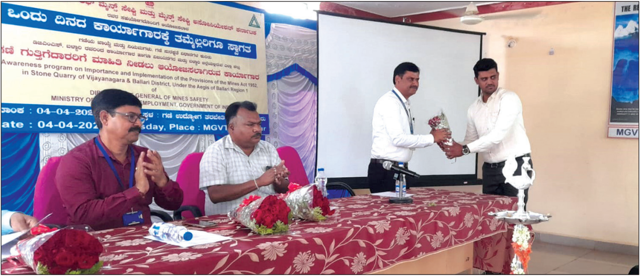
Welcoming of the Guests for Awareness Programme